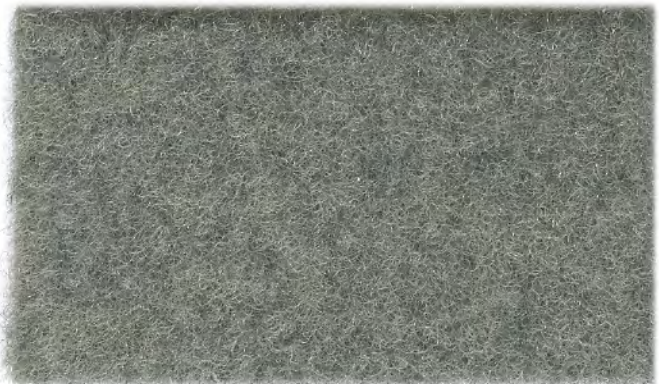
H28 Dash Grey