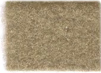
H29 Dash Beige