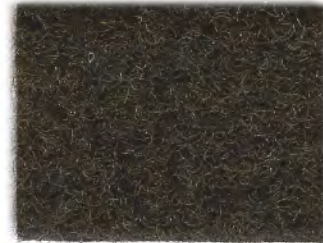
A08 Dark Brown