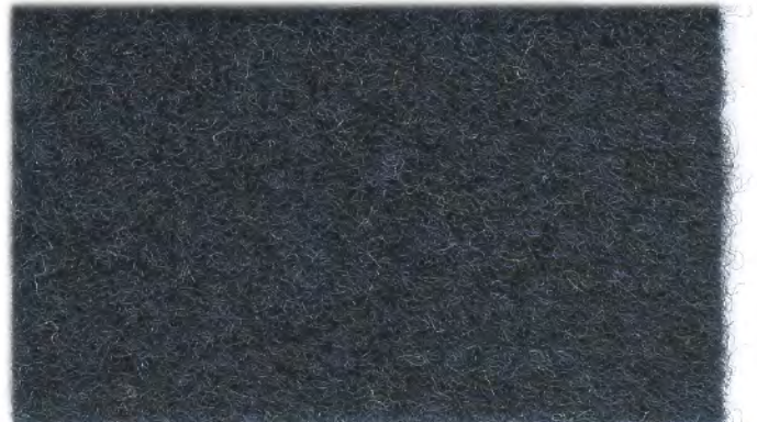
A07 Dark Blue