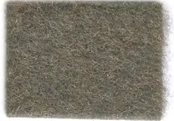
H26 Medium Taupe