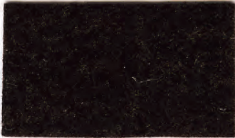
J01 Dark Brown