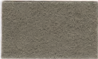
976 Ash Grey